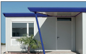
APRONS AND AWNINGS